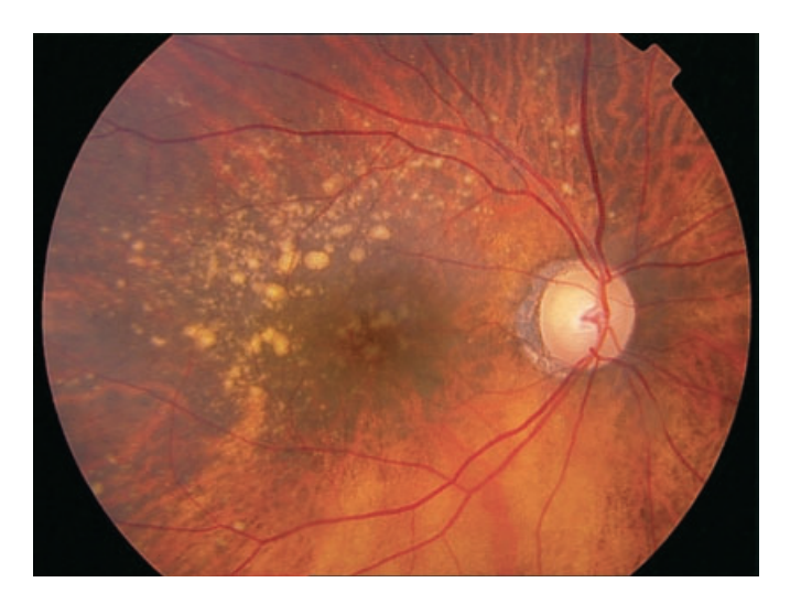
Fig. 1. Dry age-related macular degeneration (AMD) with intermediate to large drusens.

for AMD compared with having high-risk scores (p < 0.001).